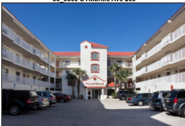
River Bend Front entrance