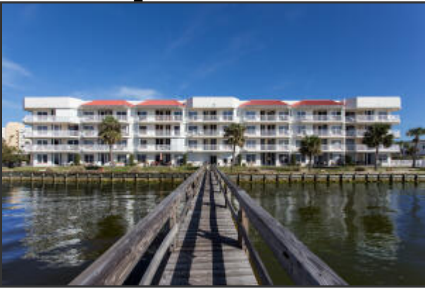
Rear of building