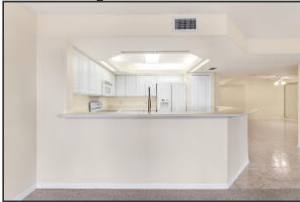
Kitchen Breakfast Bar