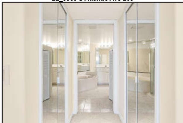
Main Bedroom His/Hers closets