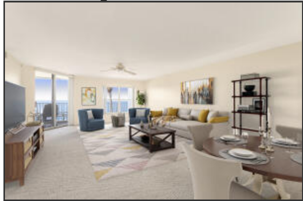
Living Room - staged