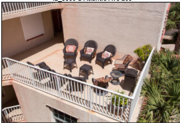
3rd Floor Patio, available to all to use