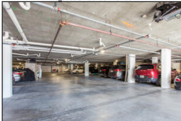
Underground parking with assigned space