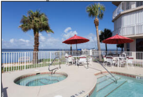
Jacuzzi with River View