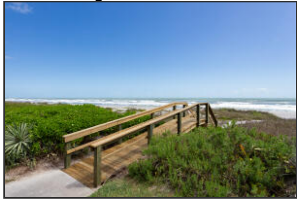
Passover to Beach across the street