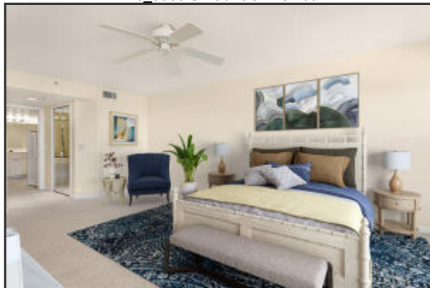
Main Bedroom - staged