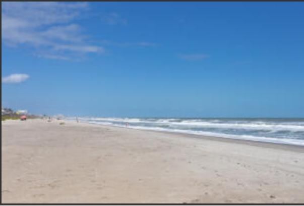
Quiet Beach across the street