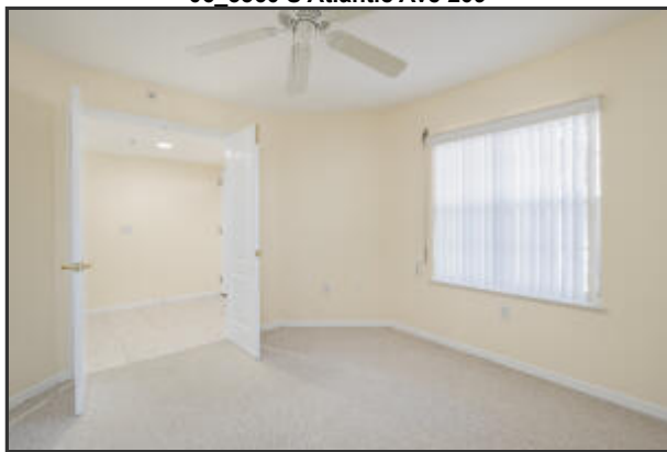
3rd Bedroom. Can also be an Office