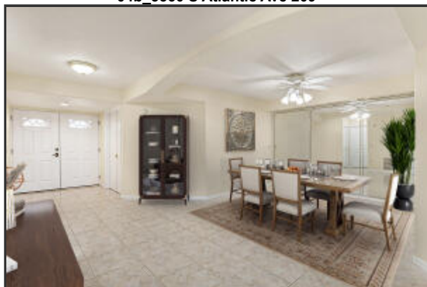
Dining Room - Staged