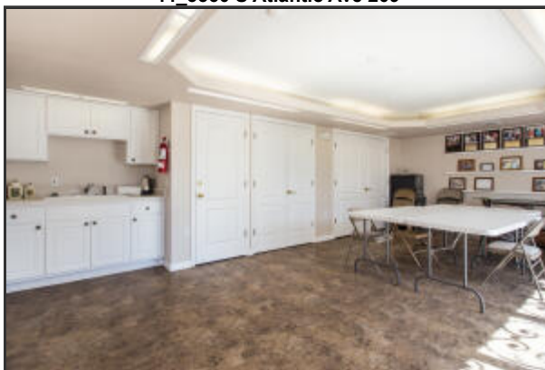
Club / Meeting Room