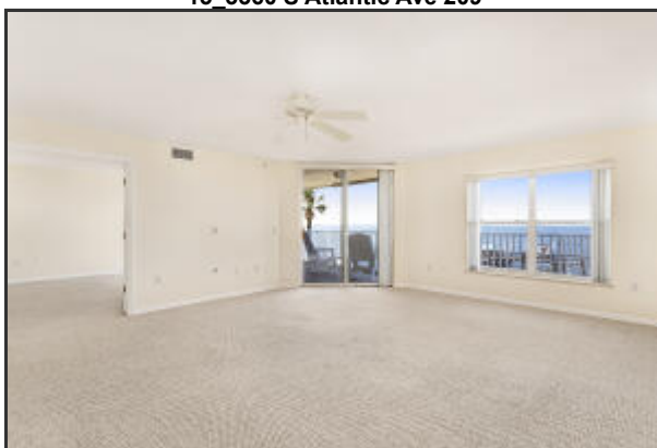
View of entries to Main BR & Balcony