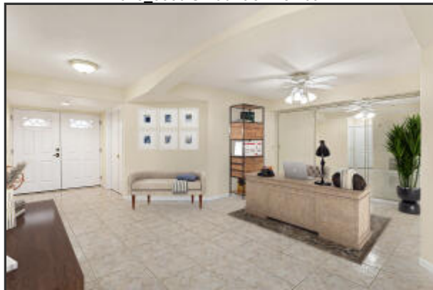
Office suggestion - Staged