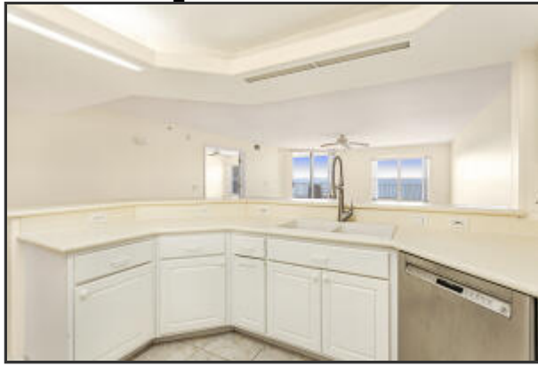
View from Kitchen