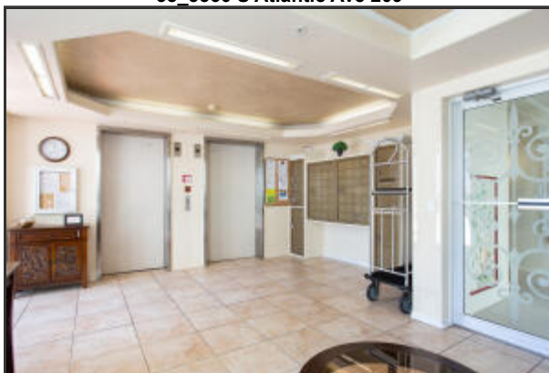
Mail boxes and Double Elevators