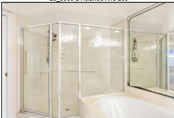
Main Bathroom with Jumbo sized Tub and Shower