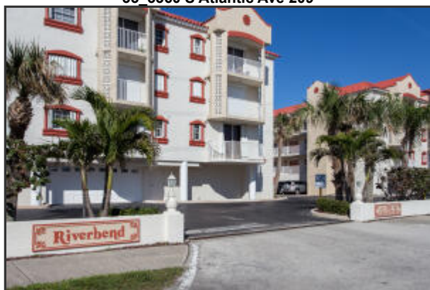
River Bend Condominium