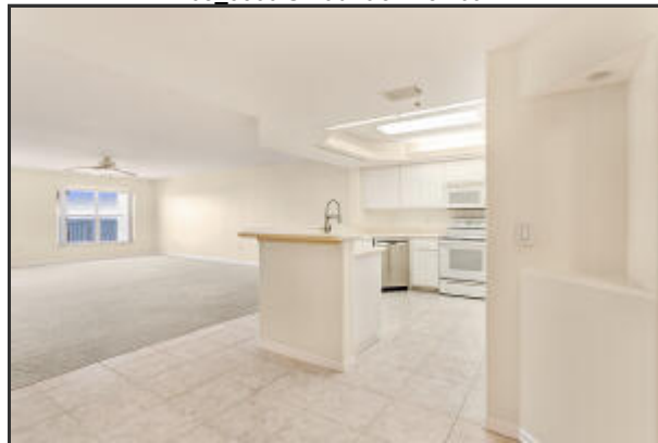
View of Kitchen and Living Room