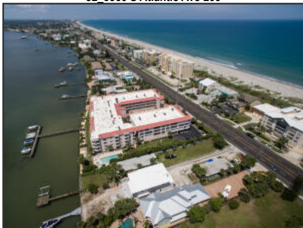
Overhead View of Banana River and Atlantic Ocean