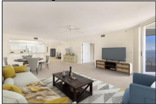
Living Room - staged