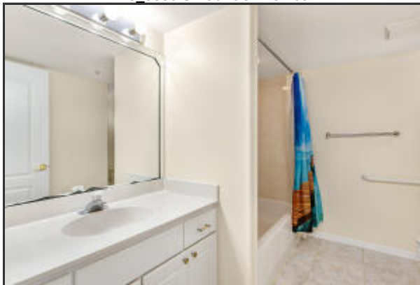
Hall / Guest Bathroom