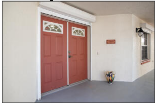
Front double doors