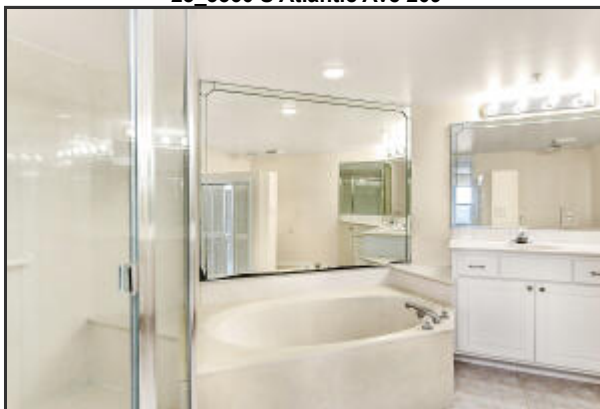
Main Bathroom with Jumbo sized Tub and Shower