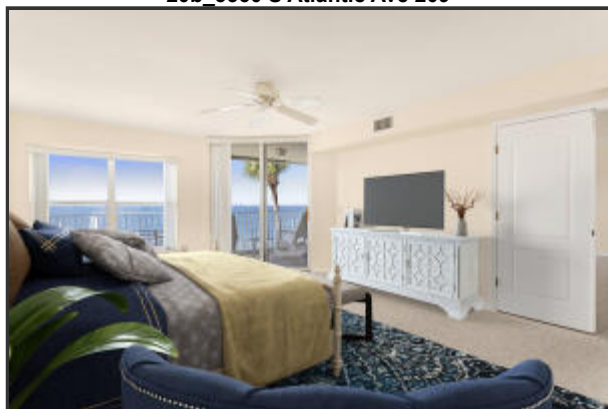
Main Bedroom - Staged