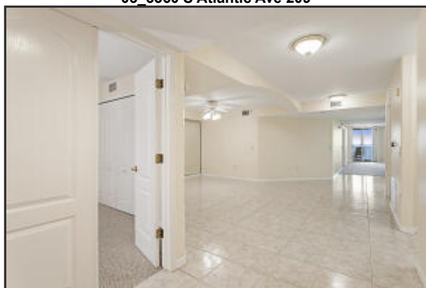
View from Entry