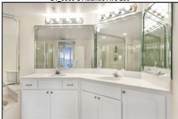
Main Bath Double sink vanity