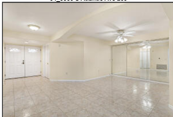
View of Dining Room & front Door