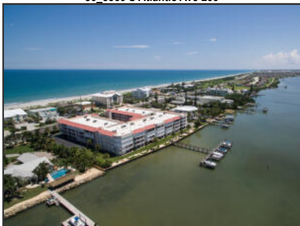
Overhead View of Banana River and Atlantic Ocean