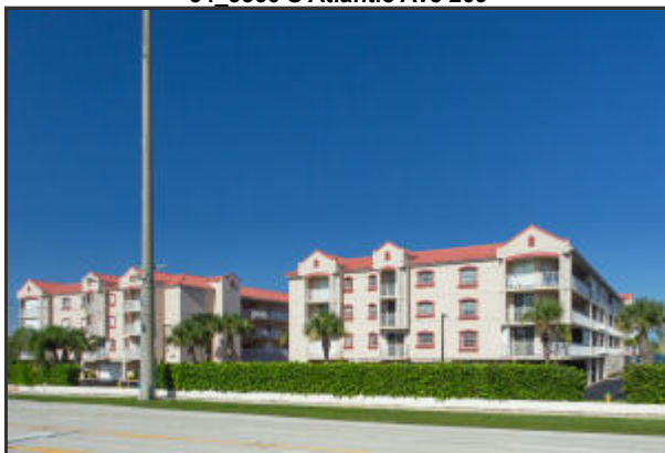
River Bend Condominium