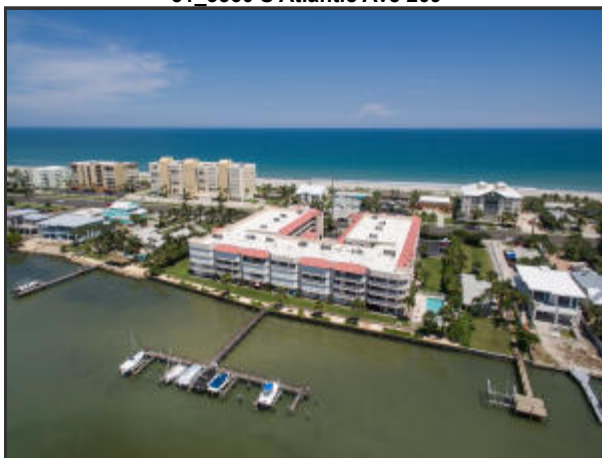
Overhead View of Banana River and Atlantic Ocean