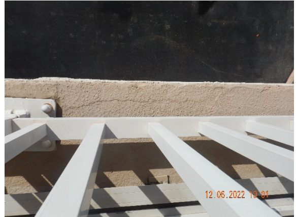
Photograph 2: Edge Crack