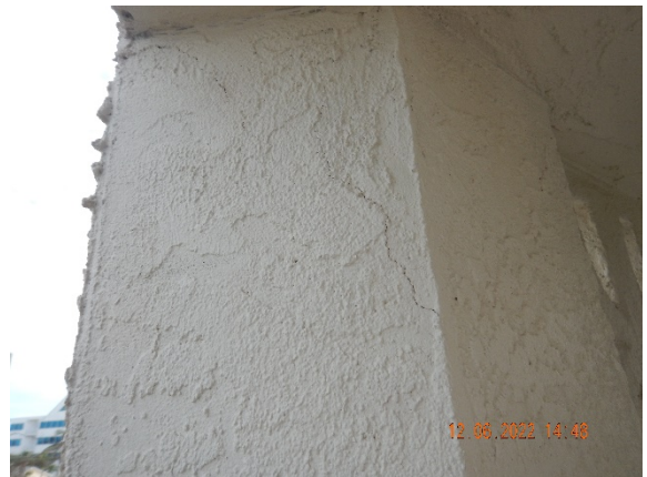
Photograph 4: Column Crack