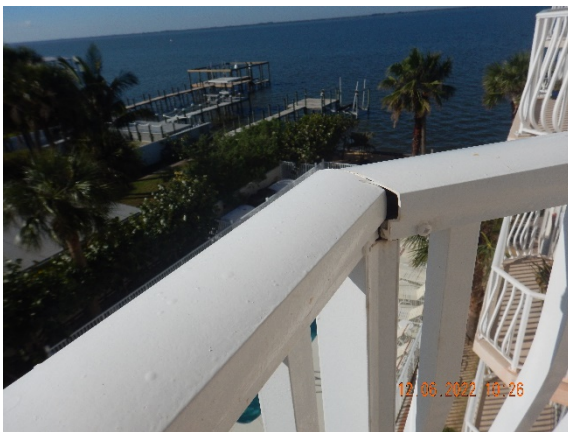
Photograph 9: Railing Alignment Issues