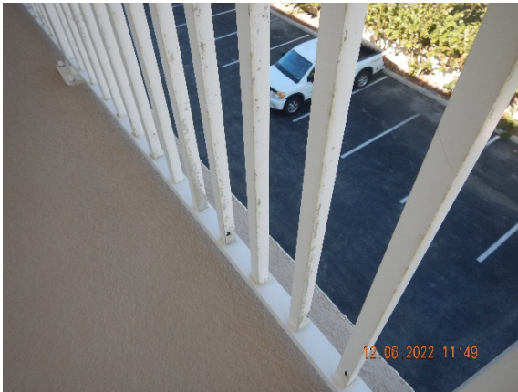
Photograph 7: Typical Railing – Coating Failure

The guardrails on the balconies are of aluminum construction and are up to current building code. The coating is no longer fully adhered to the aluminum in areas and there is significant coating failure and corrosion throughout. It is recommended that the guardrails be replaced at this time. This coating defect has become increasingly common among oceanside communities. After some research regarding coating failure analysis on aluminum guardrails, it has become apparent that this issue stems directly from improper surface preparation. Aluminum railings can last 20 plus years in a highly corrosive environment if properly surface prepped, properly coated and correctly maintained. New aluminum guardrails should also have a 5 (or more) year warranty. Balcony coating and balcony guardrail pricing have been input into the engineering estimate under Alternates . This is an asset preservation item as well as an aesthetic one.