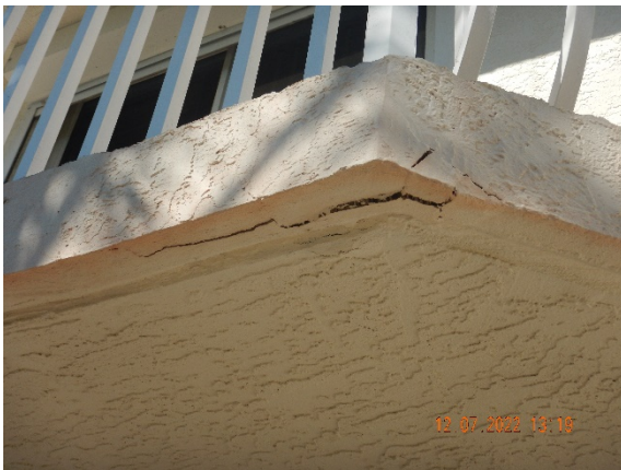
Photograph 3: Edge Spall