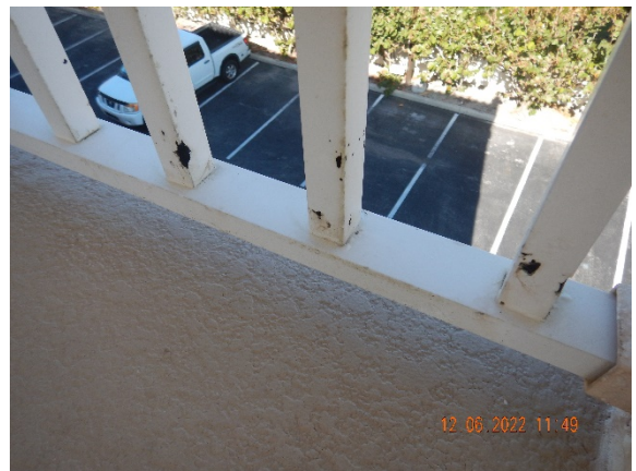
Photograph 10: Coating Failure/Picket Corrosion