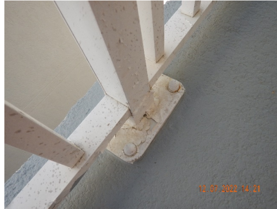
Photograph 16: Railing Coating Failure