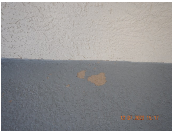
Photograph 13: Walkway Coating Failure