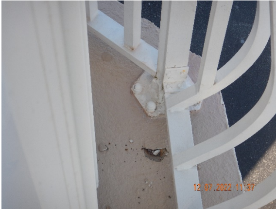
Photograph 1: Deck spall

The damage on the reinforced concrete balconies consisted mostly of edge spalls, window sills, and deck spalls which is common to beachside condominiums. There were also some spot corrosions, and some delaminated stucco. These are all asset preservation items and should be repaired. The balconies are constructed of post-tension cable reinforced concrete and CMU walls.