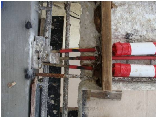
Photograph 5: Lock-off on the left and a cable splice on the right (Example)

The distributed post-tension (PT) cables that are running throughout the building are anchored in the edges of balconies and walkways. As the edges of the balconies corrode and the concrete becomes more damaged, there is a greater chance that the anchor will pop out of the edge due to this concrete damage. An example of a repair would be as such: in order to repair the south edge of a balcony, the cables with anchors in the repair area have to be “locked off” so that the tension on the cable is moved away from the edge and the workers do not harm themselves or the building. The cables are spliced with a new section of cable and anchor in the new concrete repair area. The cable is pulled through the new anchor and re-tensioned and the lock-off is removed. The lock-offs are located at least two feet away from the edge in order to have room for the splice. This creates a greater repair expense due to the cable repairs, lock-offs, and additional concrete. However, buildings built with PT cables generally see a greater period of time between repair cycles.