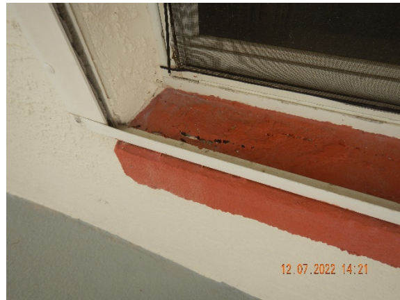
Photograph 12: Walkway Sill Spall