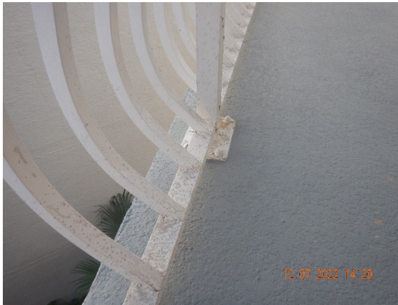
Photograph 15: Railing Coating Failure

The guardrails on the balconies are of aluminum construction and are up to current building code. The coating is no longer fully adhered to the aluminum in areas and there is significant coating failure and corrosion throughout. It is recommended that the guardrails be replaced at this time. This is an asset preservation item as well as an aesthetic one.