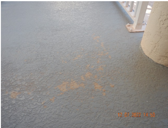
Photograph 11: Walkway Coating Failure

The walkways currently have a knock down textured acrylic coating system installed. On most floors, the coating appears to be at the end of its protective life cycle. Since it is recommended that new rails be installed, it would be a good opportunity to install a new acrylic coating system. A new acrylic coating system will extend the service life of the walkways as it will delay corrosion of the reinforcing bars. Coatings are your first line of defense against the harsh coastal environment. This is an asset preservation item as well as an aesthetic one.