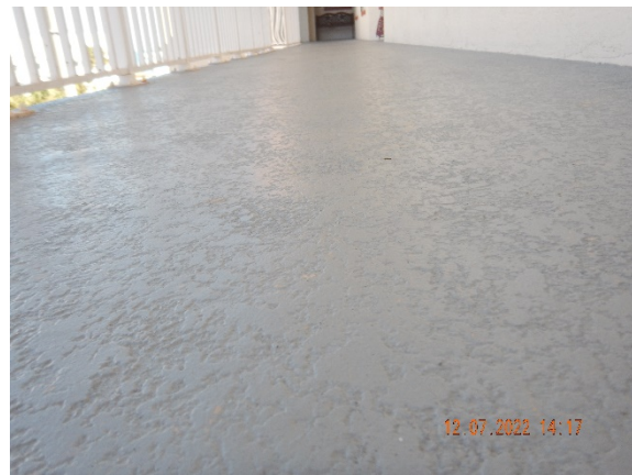
Photograph 14: Typical Walkway Texture