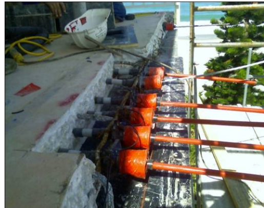
Photograph 6: New cable ends and anchors being installed (Example)

PT buildings are difficult to quantify because the anchors and cables are unable to be seen. The estimate is based on approximate anchor locations per the provided building plans plus knowledge acquired working on other PT buildings. However, without being able to see the condition of the cable or anchor, the PT lock-off quantities estimated are a best educated guess value. The only way to determine exact repair quantities is to start the repair process. A high contingency is recommended on any restoration project involving PT construction. This is an asset preservation item.